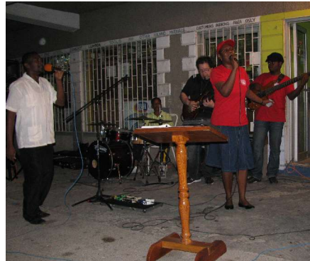
Street Meeting in the Community of Anchovy