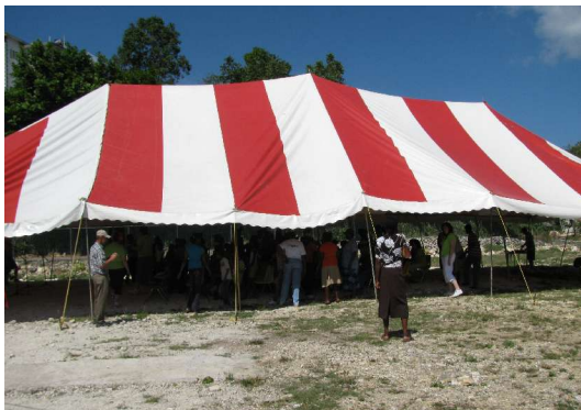
Tent used for Crusades and other Ministry

We also seek to meet the Spiritual needs of people through Mass Evangelism methods such as Tent Crusades, Street Meetings, Workplace Devotions, School Devotions, etc.